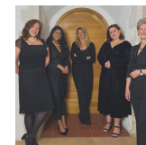
Papagena Guest Artists A cappella vocal group www.papagena.co.uk